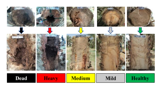
Fig. 3: Established levels of red palm weevil infestation index

difference between the treatment and control for both larval and pupal RPW stages after 2 months of pesticide application according to the found and collected individuals (although surprisingly few RPW individuals (live or dead) were found). Mortality rates were 86 and 100% for larvae and pupae, respectively. Date palms observed after 6 months of pesticide application revealed 100% mortality, with 12 dead RPW larvae. Date palms observed after 12 months of pesticide application revealed 100% larval mortality and revealed significant difference in comparison with the control. Moreover, no live or dead RPW pupae were recorded.