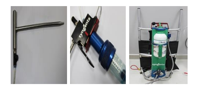
Fig. 1: Tree Micro injector (TMI) Device

After cutting of the date palms it was found that some of the date palms in all treatments were heavily infested, but these infestations were old. In contrast, some trees were completely healthy. Mortality rates of all RPW stages after 2, 6 and 12 months of pesticide application were statistically compared (Table 3). The results revealed significant